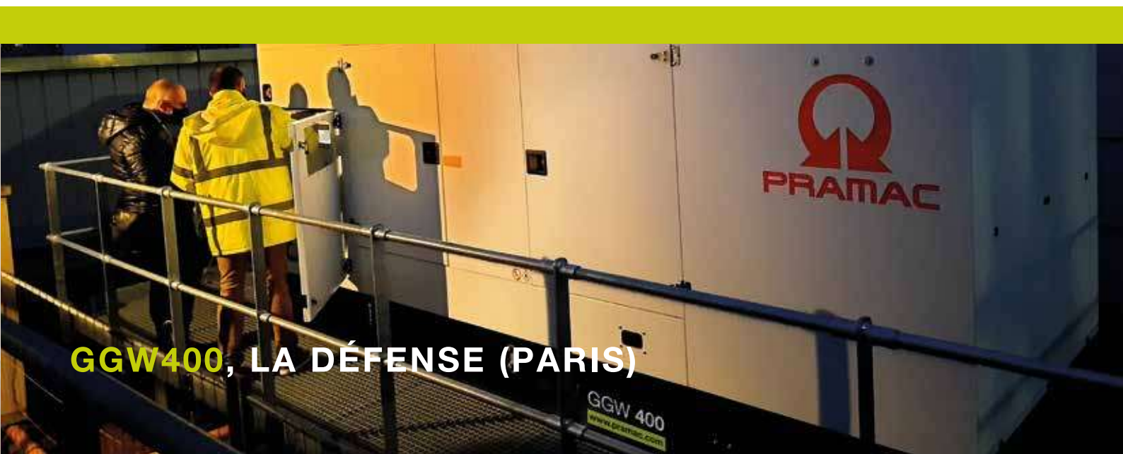
GGW400, LA DÉFENSE (PARIS)

**The data refer to the products for the Non European markets